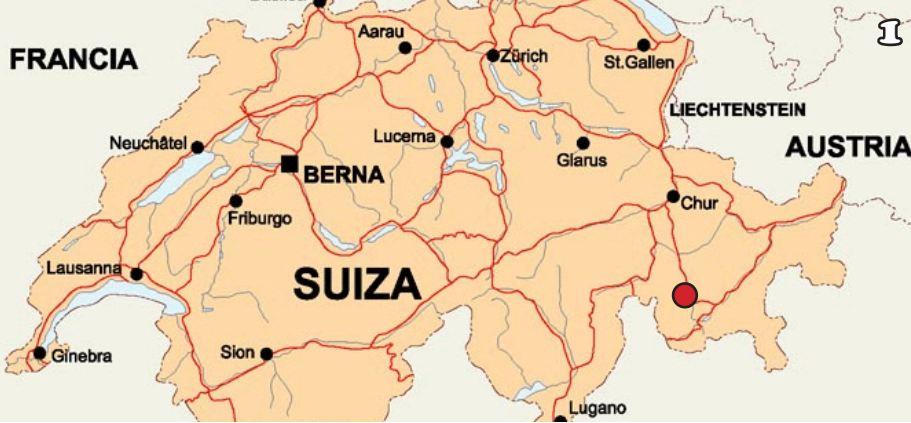
Julier Pass, Graubünden, Swiss