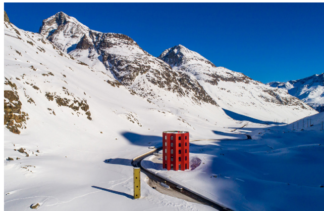
Julier Pass, Graubünden, Swiss